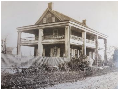
Endicott House, Port Republic; ACHS photo #1549