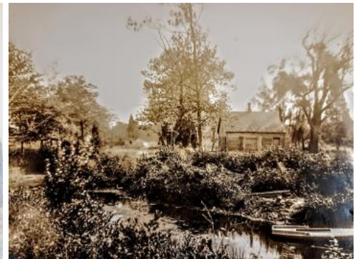
Old School House at Port Republic