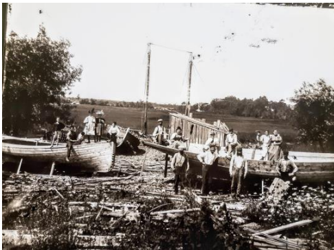
Constructing a vessel @Samuel VanSant's Boatyard; ACHS glass plate negative #367