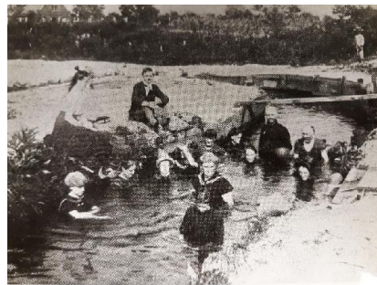
L-R: Roundhouse, Egg Harbor City, Dr. Smith's Hospital, Egg Harbor City, Smith's Fountain of Youth