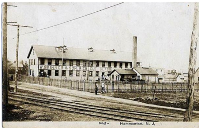
W. Skinner and Sons Cut Glass factory in Hammonton about 1908

Thomas Skinner III continued the family business until he retired in 1995. An avid racing enthusiast, he converted parts of the building for stock car work. The factory closed in 1995 and the abandoned building was destroyed by a suspicious fire in 2011.