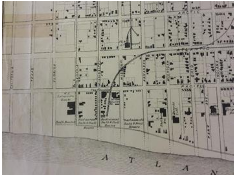
Above: 1884 Map of Atlantic City showing little development below Georgia Ave.