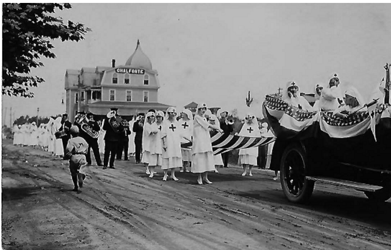
Parade, Red Cross group in front of Chalfonte Hotel in Atlantic City, circa WWI. From ACHS photo file #600.